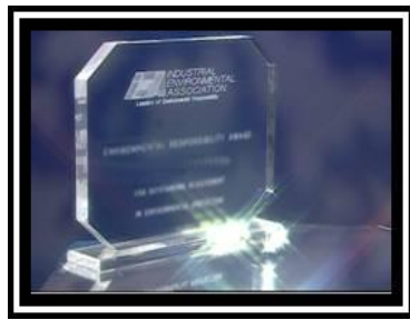
Presentation of 2011 Environmental Excellence Awards